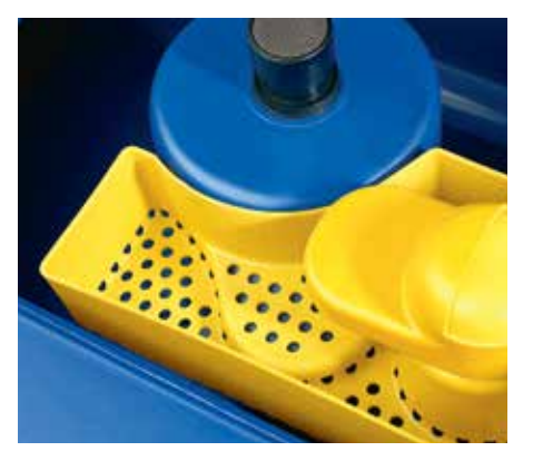
Recovery tank has large opening to make it easy for thorough sanitizing. The debris tray is easy to remove and clean, keeps large recovered debris from plugging your facility drain