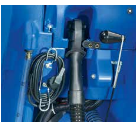
Rear solution fill allows filling when the machine is back into the deep sink for emptying the recovery