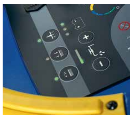
One-touch controls minimizes the risk of operator error for improved safety and better cleaning results