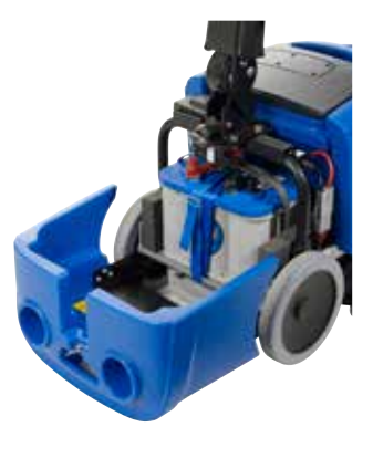
The onboard battery charger gives quick access to charging when needed.