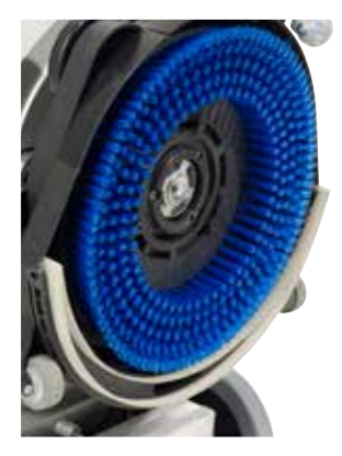
The brush and squeegee blades can be easily removed, cleaned and changed without the use of tools.