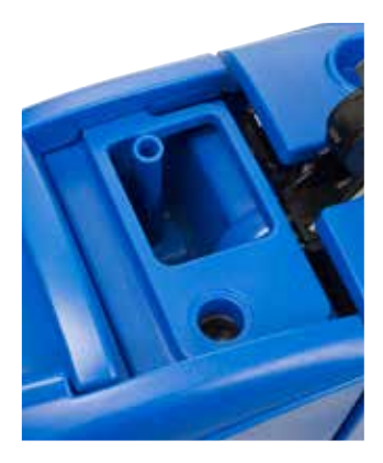
You can easily and quickly remove the tanks and fill, drain and clean them away from the machine.