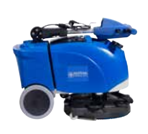
The compact design and foldable handle make SCRUBTEC 337.2 easy to transport and store, even where space is limited.