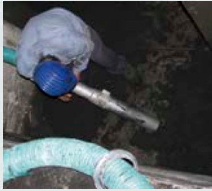
Recovery of foundry sand from pits