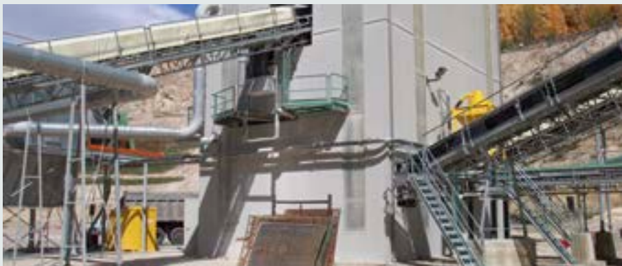
System for the recovery of raw materials