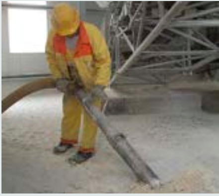
Recovery of cement