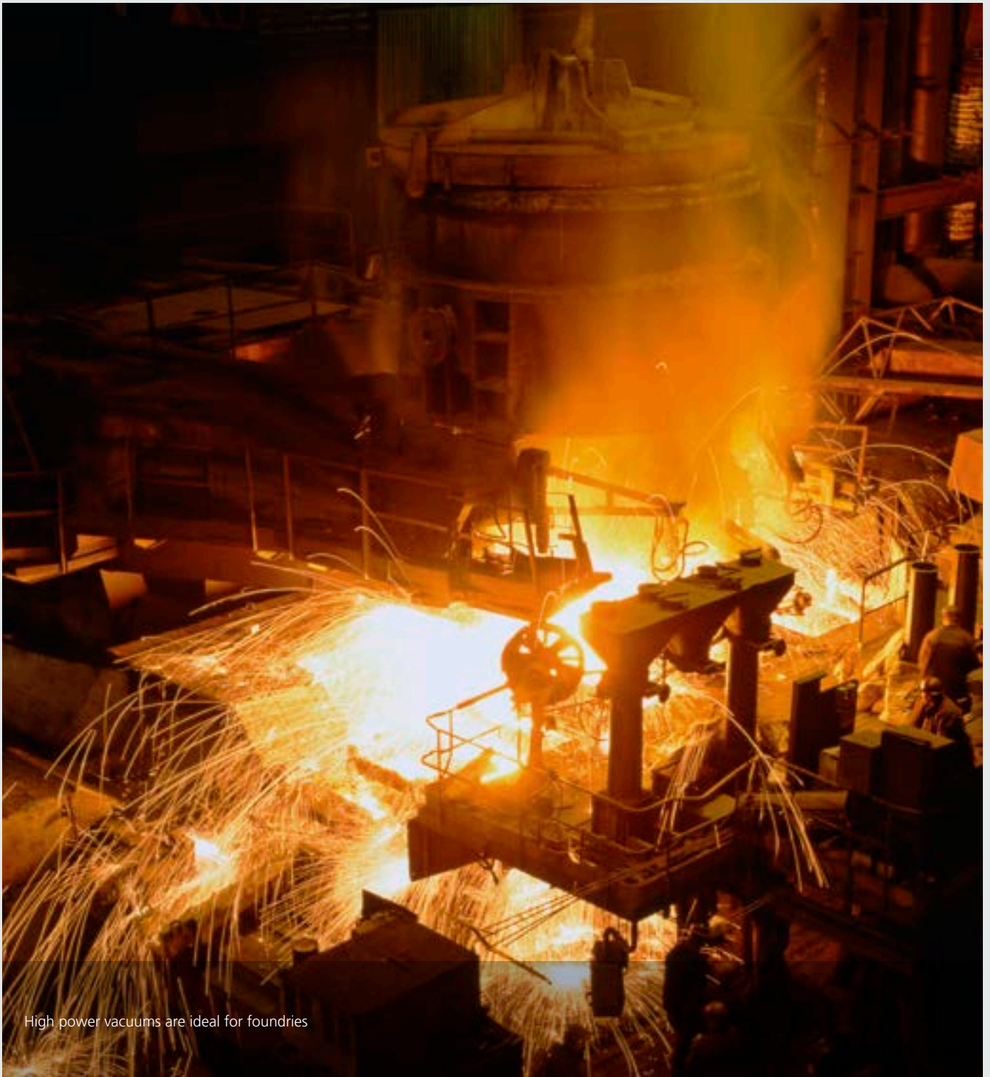
High power vacuums are ideal for foundries