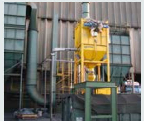
Centralized system employed in the heavy duty industry