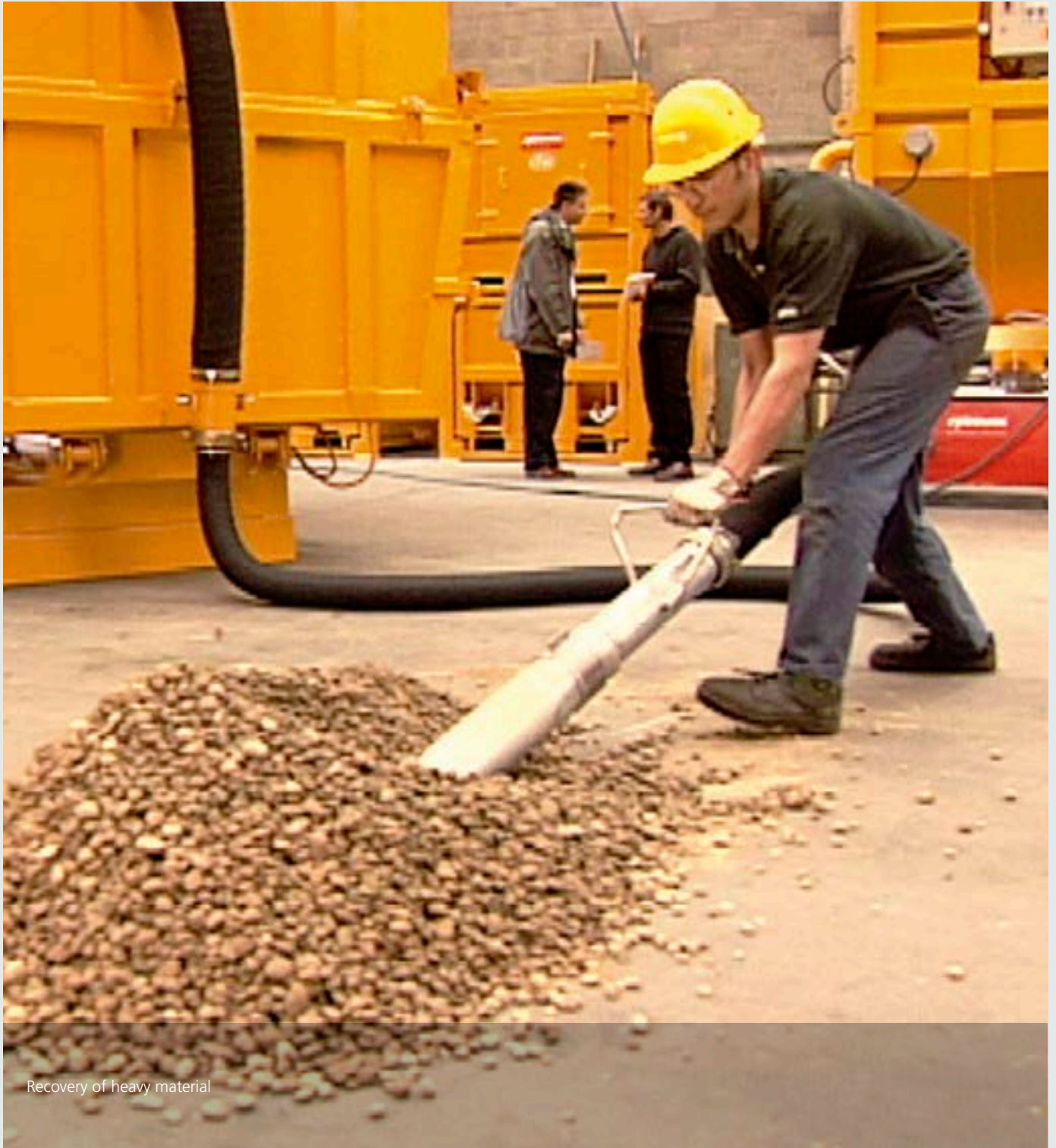
Recovery of heavy material