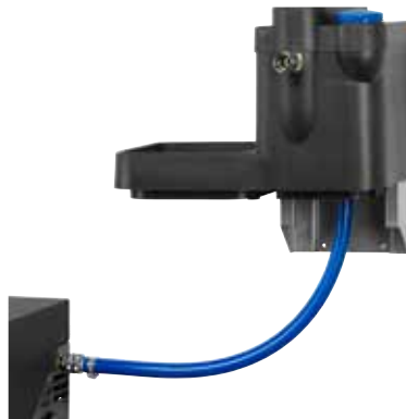
External Water Break Tank for op til 40 ltr/min.