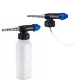
The FoamSprayer technology allows a simple and efficient application of detergent.