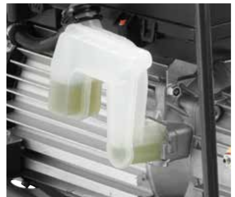
Pump oil tank with oil level sight and fill/empty function.